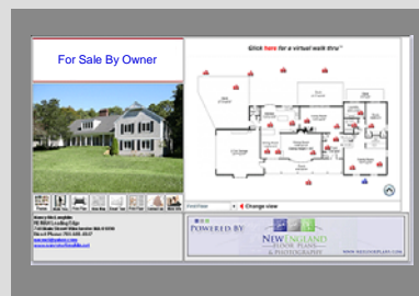
Online Virtual Tour